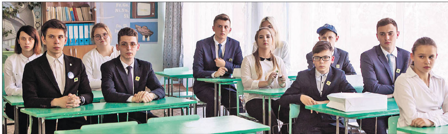
The first intake for the chemistry and technology class will consist of 11 tenth-graders who aspire to a career path in chemistry.

row – students at the university, and a bit later they will come to us as young specialists".